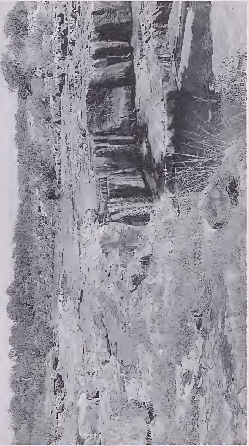
Figure 4. Eucalyptus herbertiana sub-alliance and Riverine Melaleuca leucadendra community on Woppinbie Creek, 5 km east of Cone Mountain.